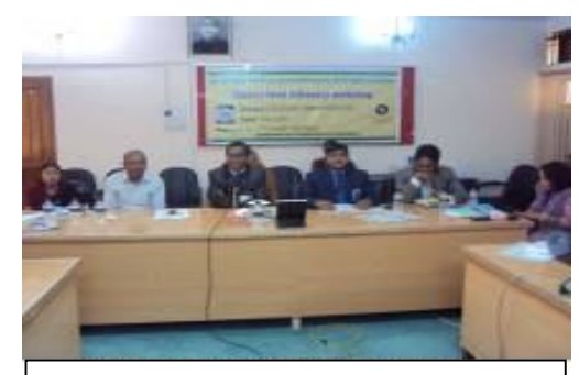
DC of Feni attended the district level advocacy meeting.