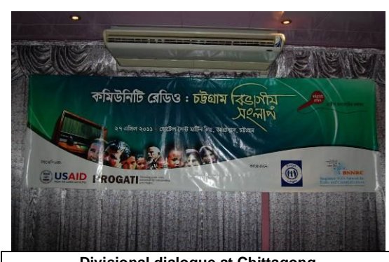
Divisional dialogue at Chittagong