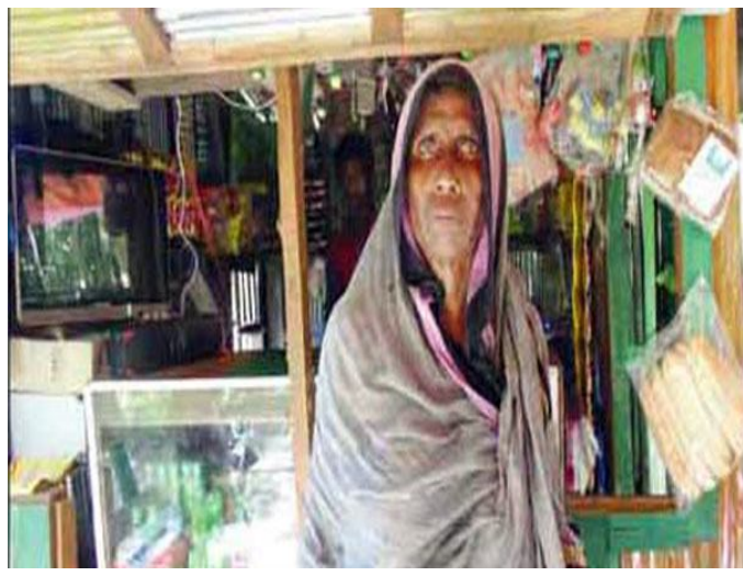
Page | 22