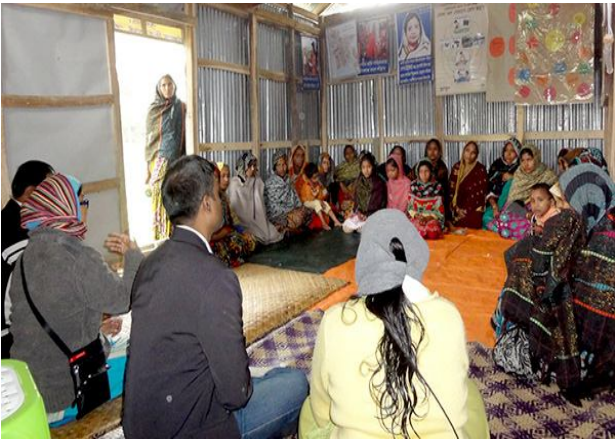
Page | 25