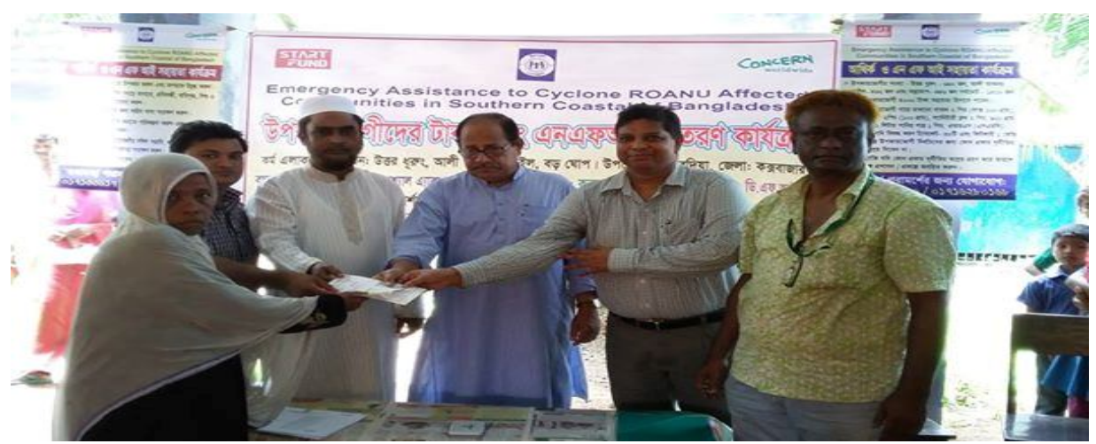
Page | 38