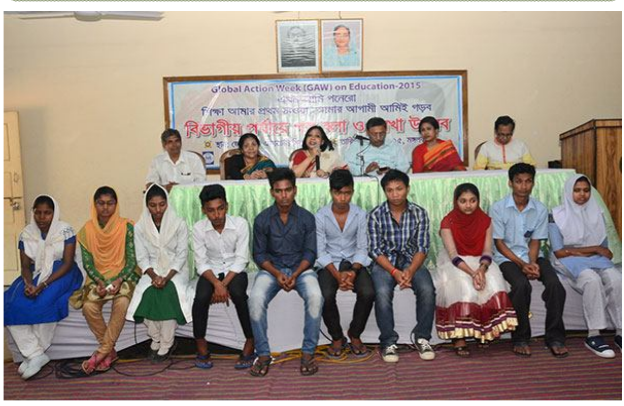
Page | 34