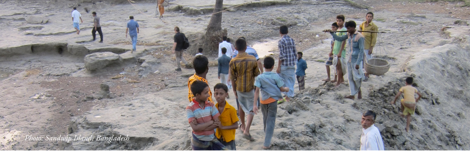
Photo: Sandwip Island, Bangladesh