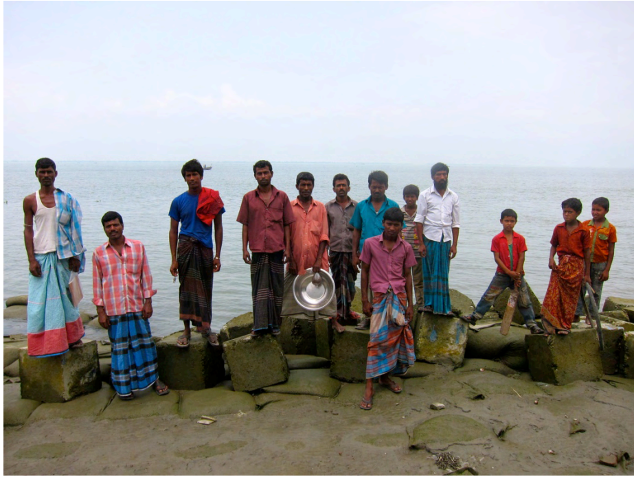
These climate affected communities are searching for new houses and new lands after being affected by dramatic river erosion along the banks of the Meghna River