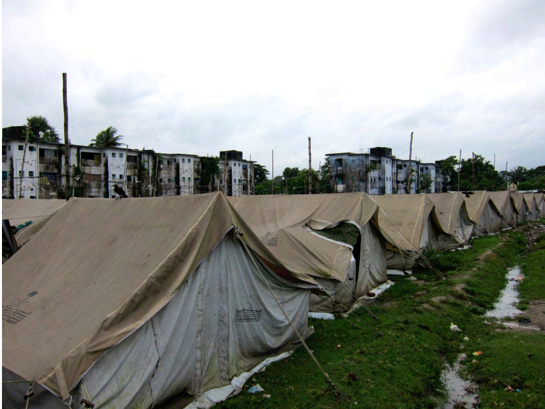
Climate Affected communities fleeing landslides are housed in a temporary tent city in Chittagong City