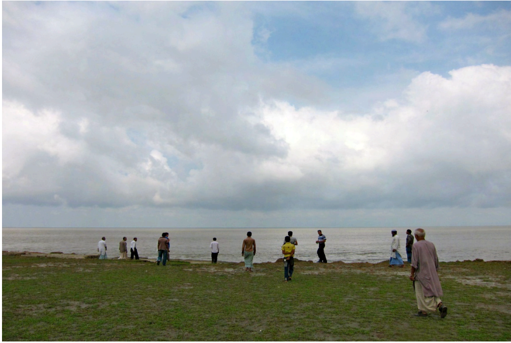
Climate affected communities survey coastal erosion and the salinification of agricultural land on Sandwip Island, Photo Ezekiel Simperingham, Displacement Solutions