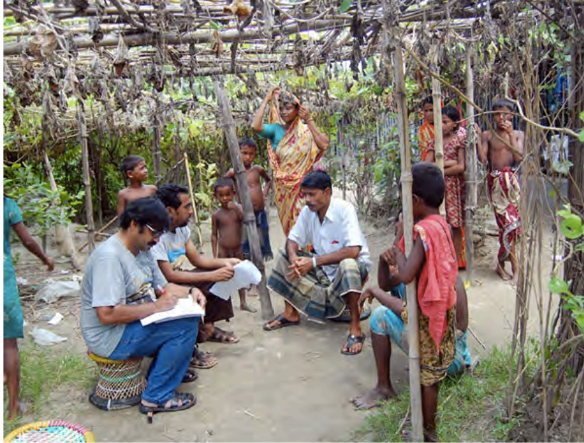
Representatives from Young Power in Social Action (YPSA) meet with Char Dwellers to discuss their concerns