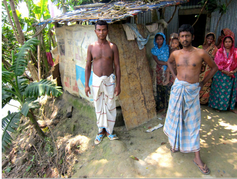
These families face the prospect of being displaced by the effects of river erosion, as their home stands on the brink of the Gumti River