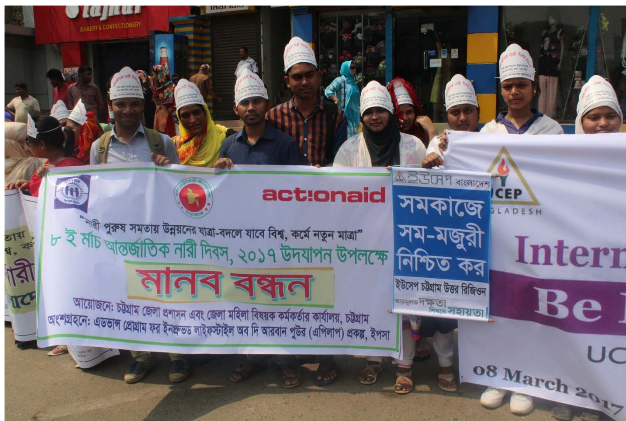
YPSA team member participation in the Human Chain at 5th March, Probortok Circle, Chittagong

'Be Bold for Change' with the theme of year 2017 YPSA observed the International Women's Day and committed to support women and girls from grassroots level to achieve their ambitions, facilitate them to cope with challenges, conscious and unconscious bias. YPSA always try to maintain the gender-balanced leadership in its all premises including grassroots level also and value women and men's contributions equally.