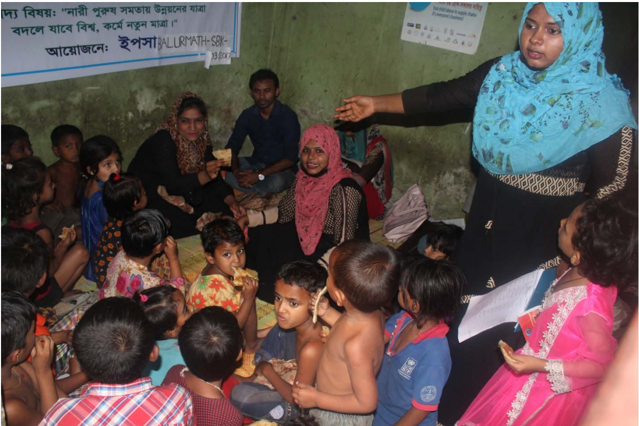
Participants of Balurmash Shishu Bikash Kendro - Ward 19,Bakalia

Around 380 children and 220 parents have signed to restraining the special clause from early marriage elimination act 2017. This special provision proposed that underage females may be married off under “special contexts” as long as it is conducted with the permission of her parents or guardians in conjunction with magistrate permission. Such a marriage will no longer be considered an offence. The children and parents signed in banner agreed that they will not let their girl under age.