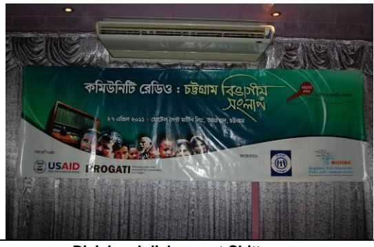
Divisional dialogue at Chittagong