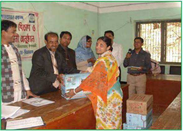
Page | 22