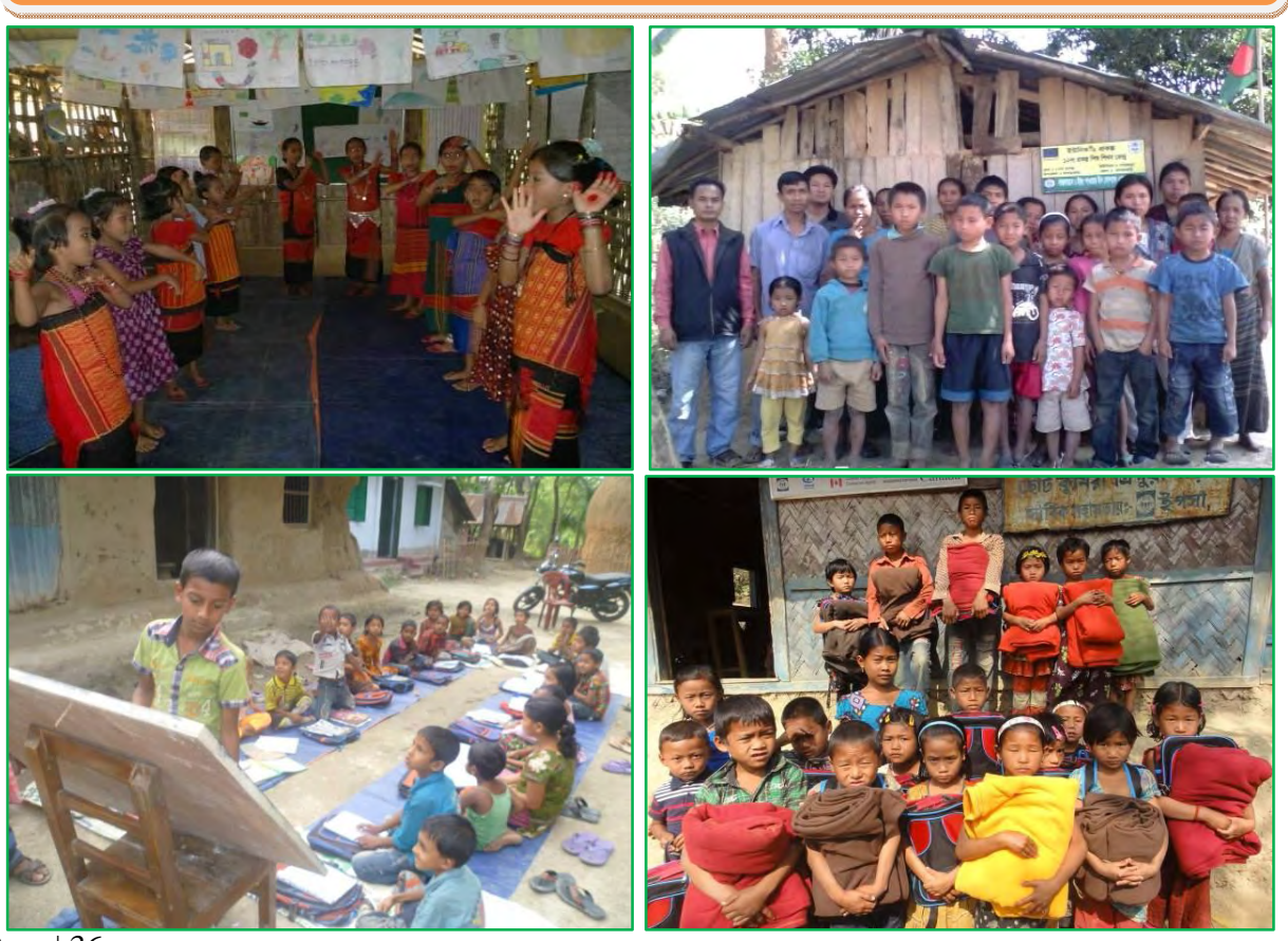
Page | 36