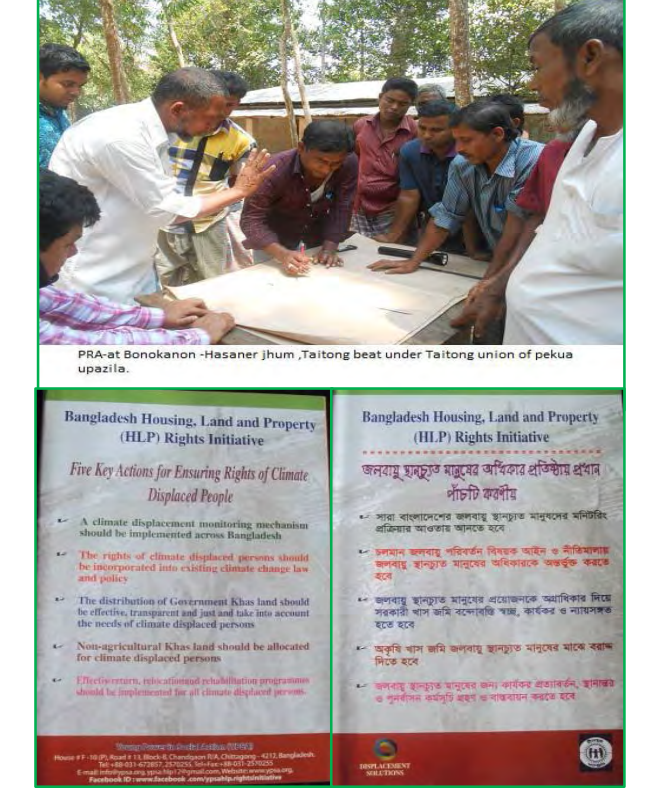
Page | 41