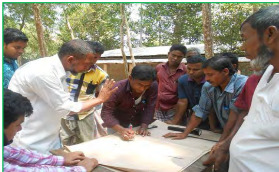
PRA at Bonokanon -Hasaner Jhum, Taitong beat under Taitong union of pekua upazila.